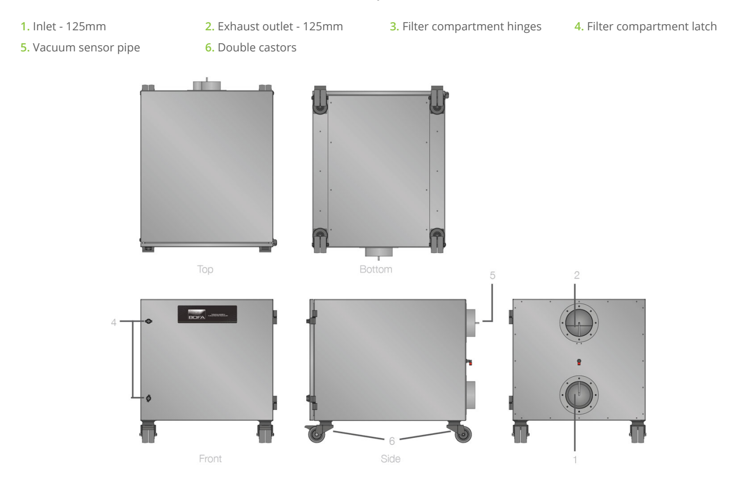
Inline filtration system